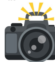
Photo packages will be available if you wish to purchase.

Our dates for photo sessions will be April 16, 17 and 18.