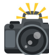
Photo Opportunity.... don't miss out...

Lifetouch, a photography company that specializes in portrait photography as well as church photo directories, will be coming to Peoples on April 16, 17, and 18.